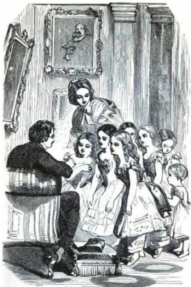
The Children coaxing Mr. Appleton to tell where Aunt Fanny lived.