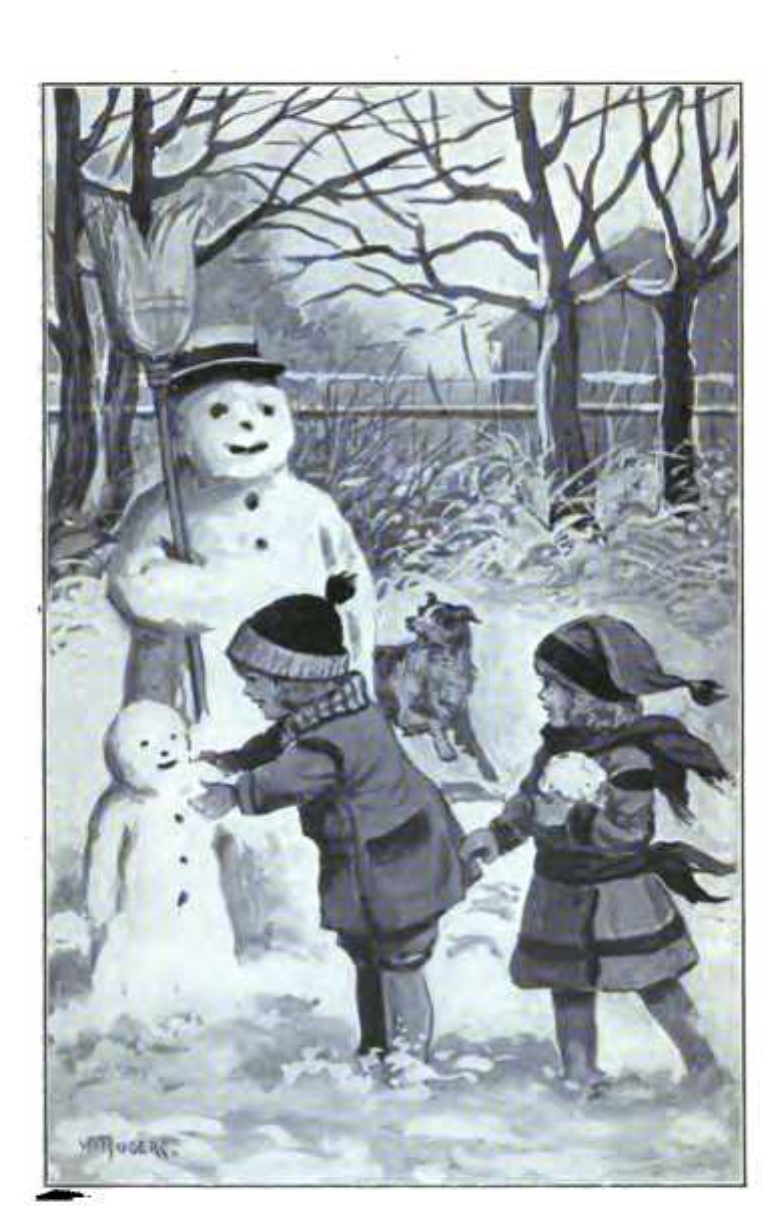
SOON HAD A LITTLE SNOW BOY WHICH STOOD BESIDE THE BIG SNOW MAN. Troins at Home. Frontispiece (Page 167.)