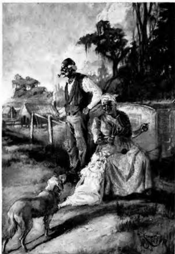
"Upon the brow of the Jevou"