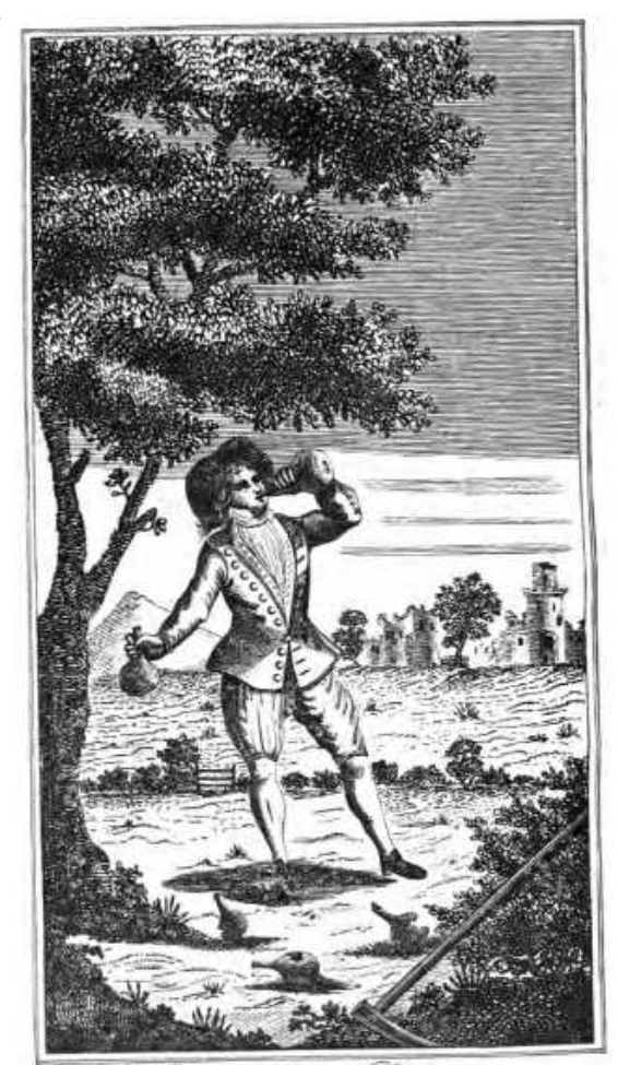
Nivimus dum Bitimus.