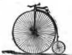
The "SPECIAL CLUB" Bicycle.