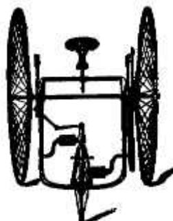
The "IMPERIAL CLUB" Tricycle.