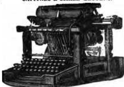
NO. 2 PERFECTED TYPE-WRITER.

A Machine to supersede the pen for manuscript writing, correspondence, &c., having twice the speed of the pen; is always ready for use, simple in construction, not liable to get out of order, easily understood. It is used in Government Offices, by Merchants, Bankers, Lawyers, Clergymen, Doctors, Scientists, &c., &c., &c.