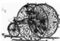
The "CHEYLMORE" Tricycle.