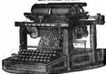
NO. 4 PERFECTED TYPE-WRITER.

✦ BEEMAN AND ROBERTS, Sole Agents for the United Kingdom, 6, KING STREET, CHEAPSIDE, LONDON. ✦