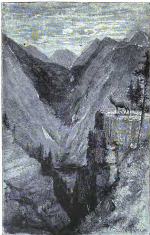
THE HOME OF THE ELK.