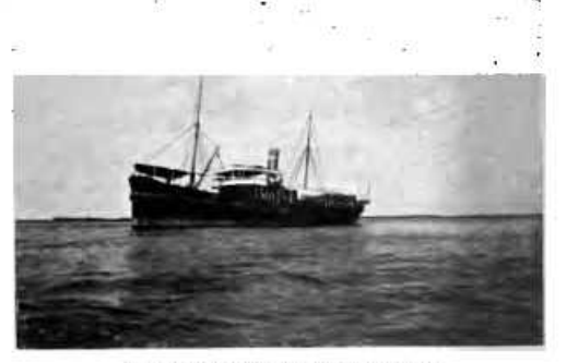
MAIL STEAMER "HORIBAT" OFF KELANTAN