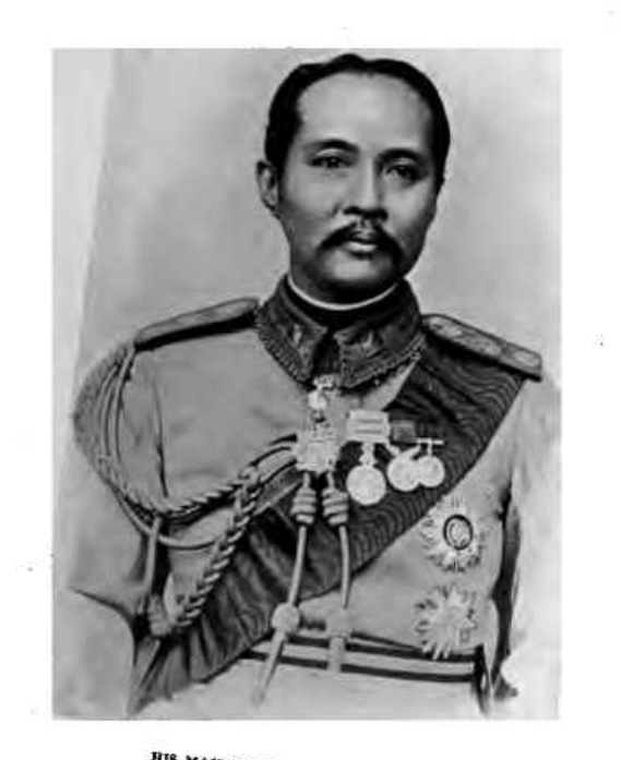
HIS MAJESTY THE KING OF SIAM.