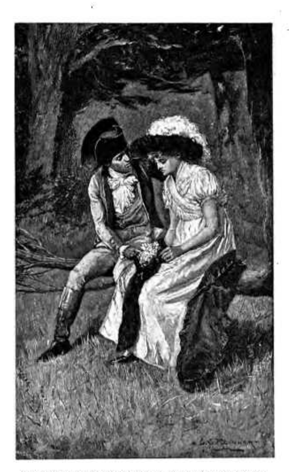
" SHE BEHELD THE OBJECT OF HER SKARCH SITTING ON THE HORIZONTAL BOUCH OF A CEDAR." [See page 54."