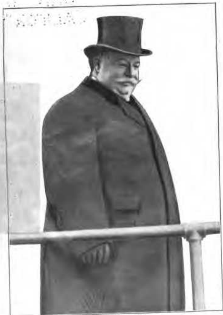
HON. WILLIAM H. TAFT, Honorary President Olympic Games, 1912.