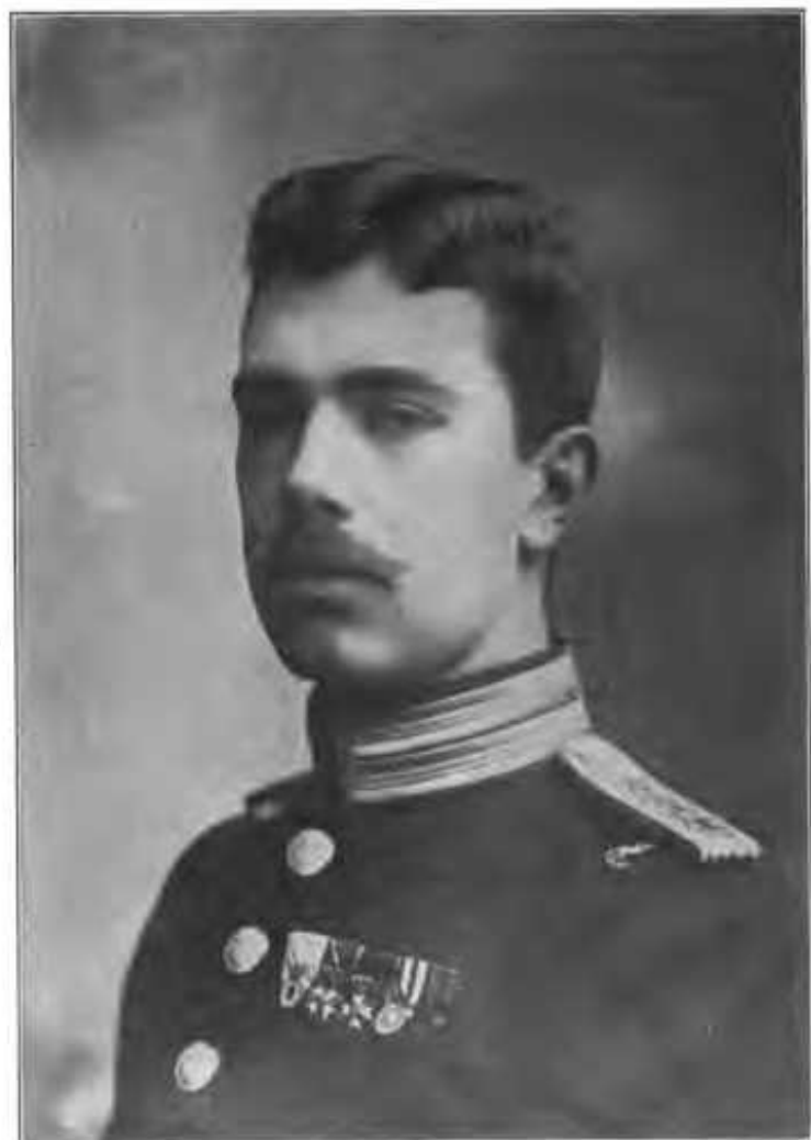
HIS ROYAL HIGHNESS CROWN PRINCE GUSTAVE, OF SWEDEN, President of the Swedish Olympic Committee.