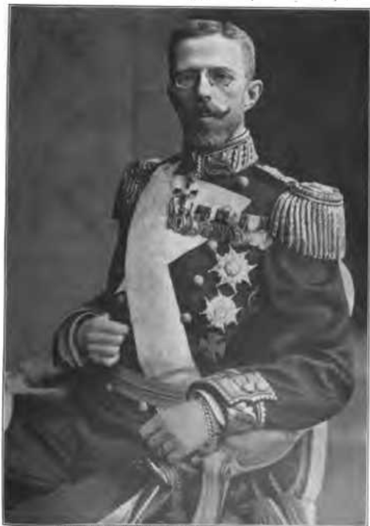
HIS MAJESTY KING GUSTAVE V., OF SWEDEN.