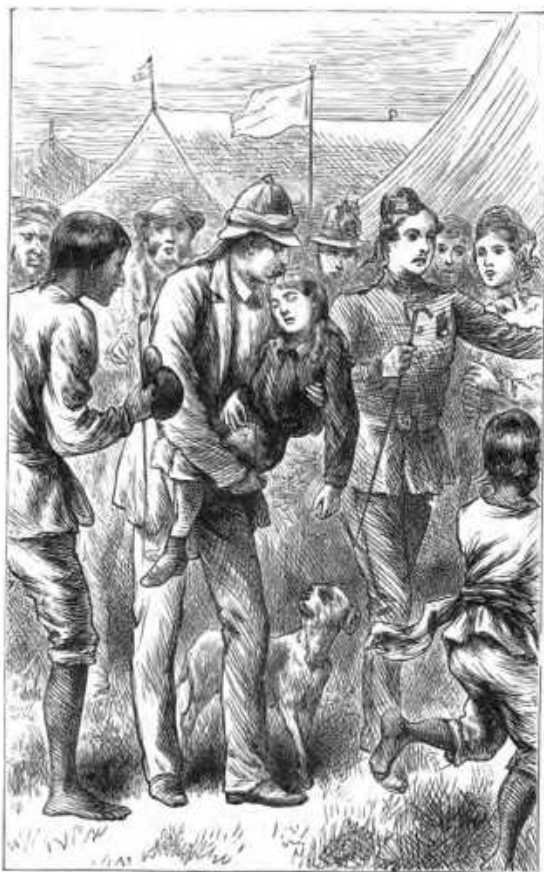
GUY IS TAKEN UP FOR DEAD.—Page 81.