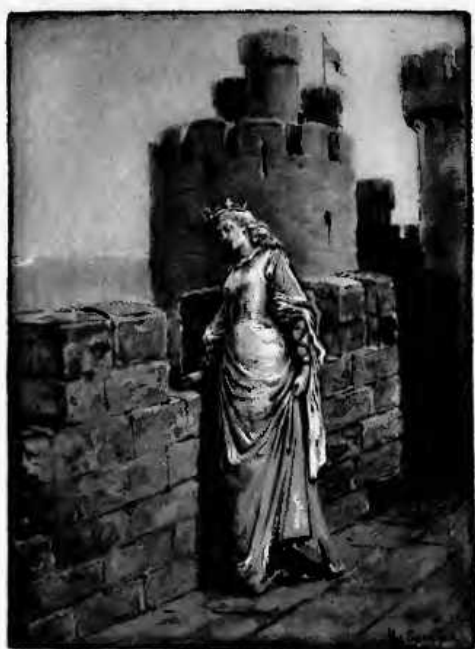
"And Guinevere Stood by the castle walls to watch him pass."