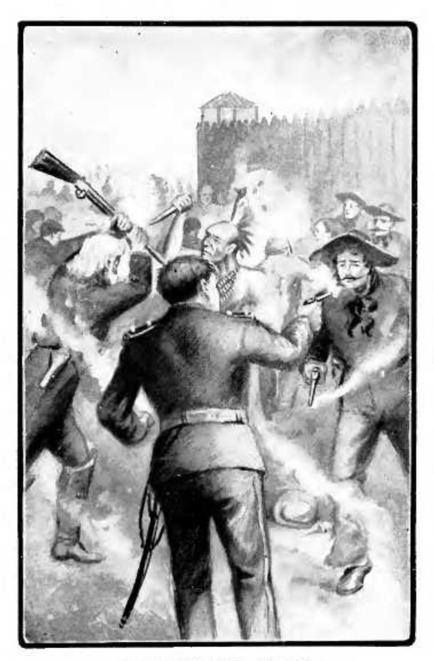
DEFENDING THE FORT.-Frontispiece, Boys of the Fort.