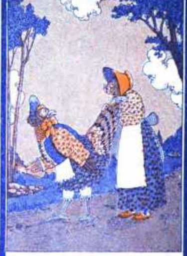
"Dun't Werry!" Said Aunt Polly Woodchuck,