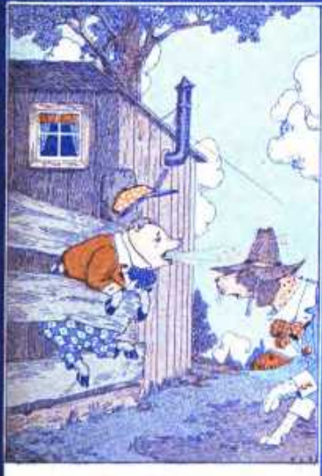
Grunty Pig Stock Fast in the Fence,