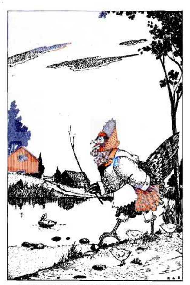
Henrietta Hen is Afraid the Duck Will Drown. Frontispiece (Page 14)