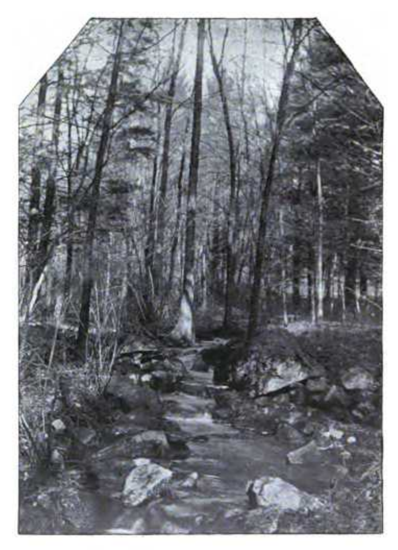
"Up in a wild, where no one comes to look, There lives and sings a little lonely brook; Liveth and singeth in the dreary pines, Yet creepath on to where the daylight shines." — Whitney.