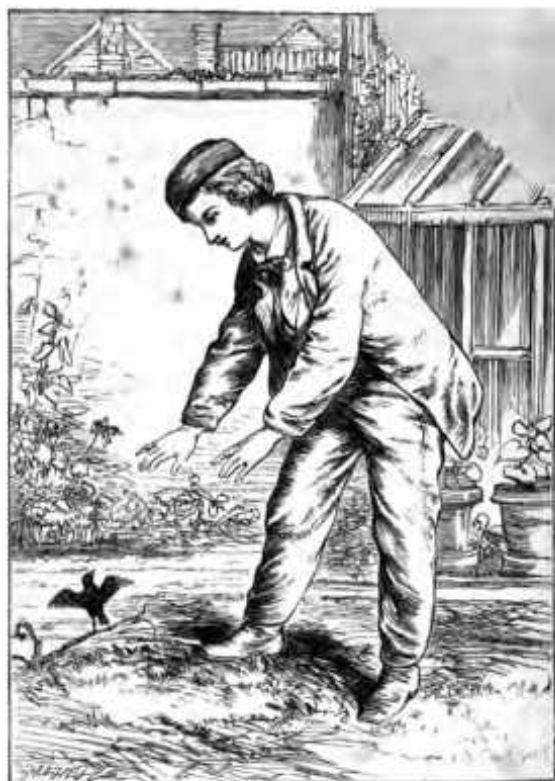
THE LUCKLESS SPARROW.