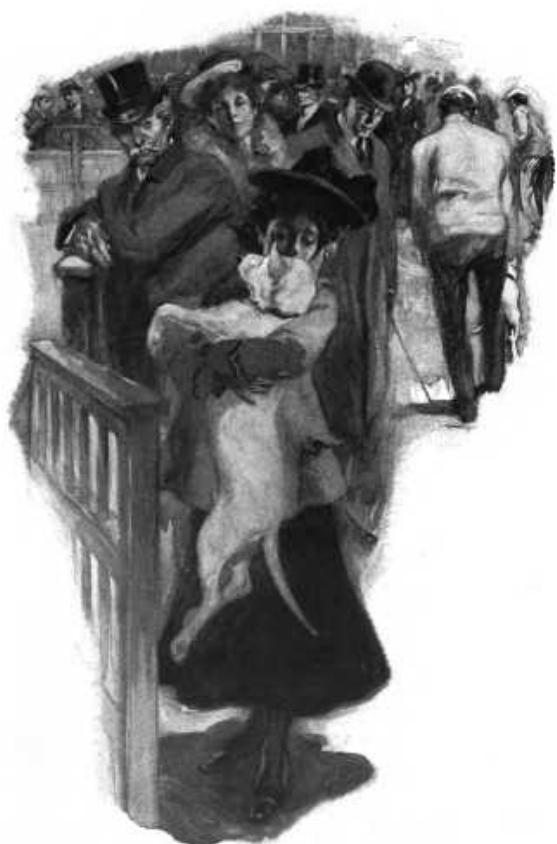
Miss Dorothy snatches me up and kisses me between the cars