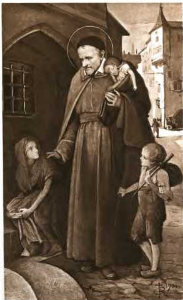
Vincent de Paul.