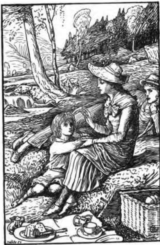
"The Story of Sunny."— Frontispiece.