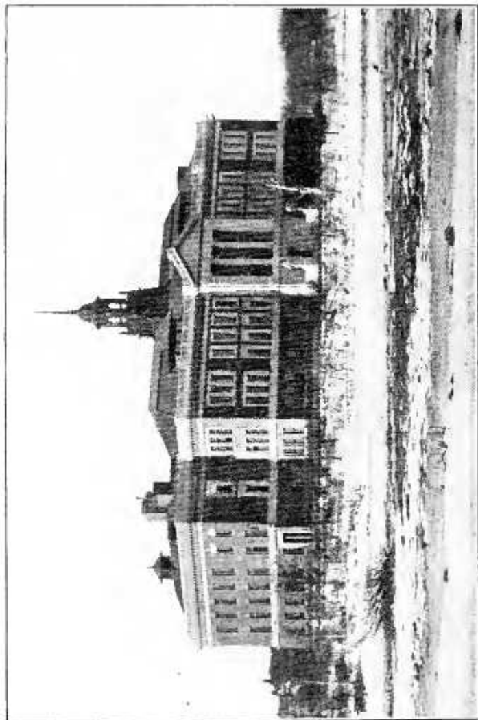
SIMMONS COLLEGE, IN THE FENWAY, BOSTON