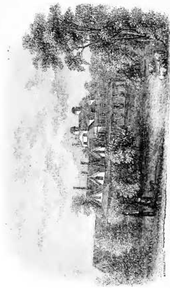
MARSHFIELD, THE RESIDENCE OF MR. WEBSTER.