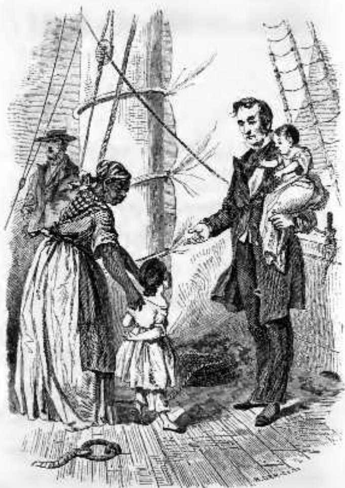
THE LITTLE EXILES.