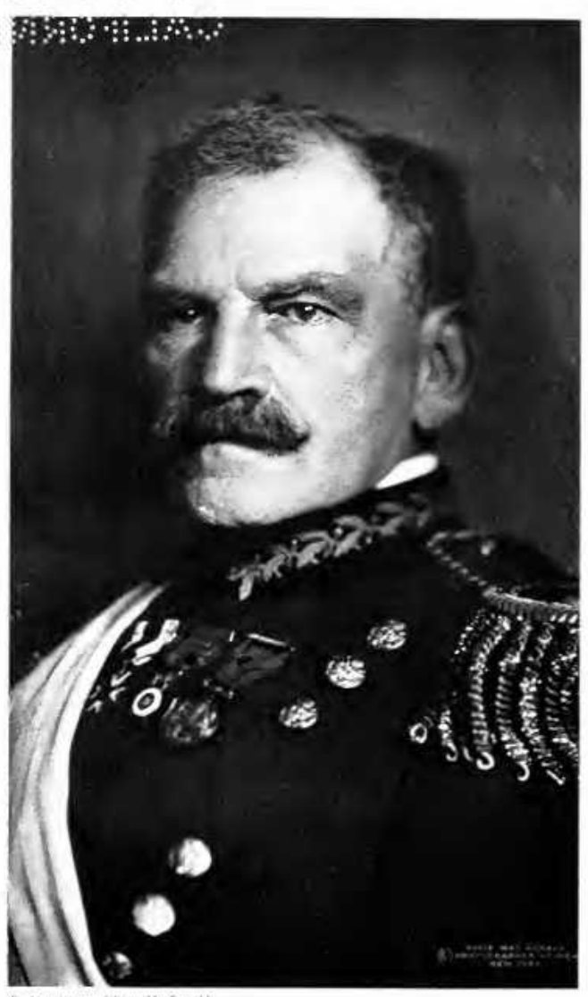
Fy providing of Pire MacDonald