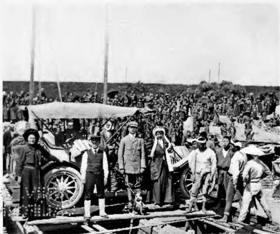
Round the World in a Locomobile. Crossing Hamana Bay, Japan, in a ferry consisting of two sail boats lashed together