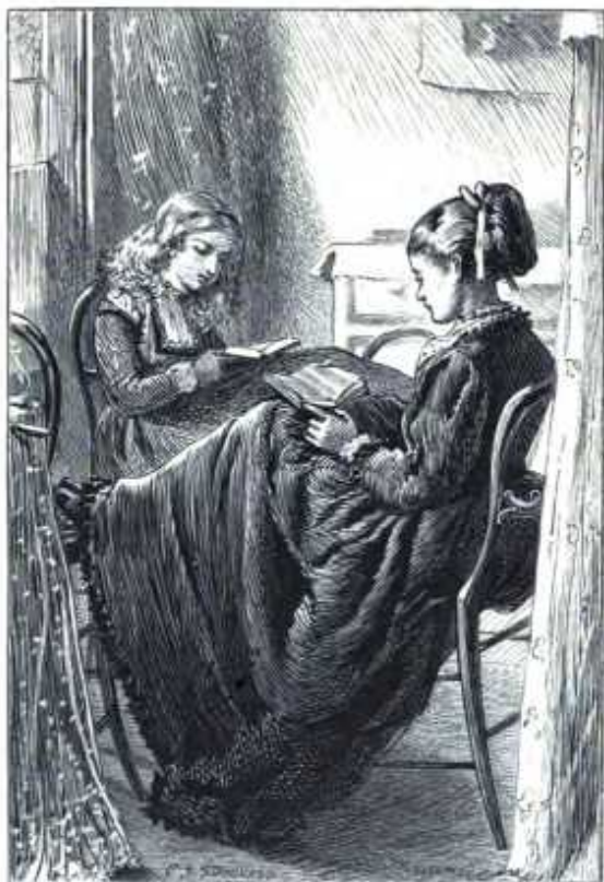
"A position which would have shocked Mrs. Foster exceedingly had she seen it"—Page 27.