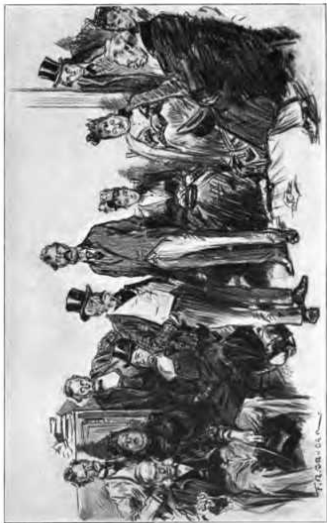
Our offices were thronged with clients of all sexes, ages, conditions, and nationalities