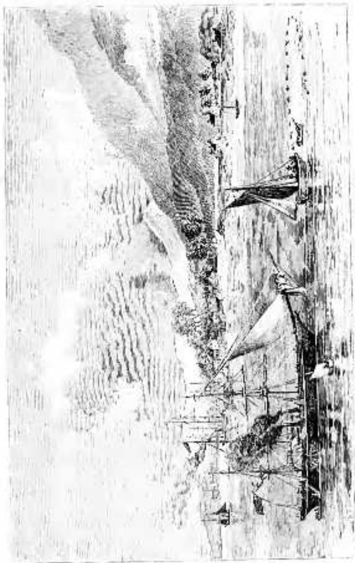
LANDING AT BEN SEVIS.