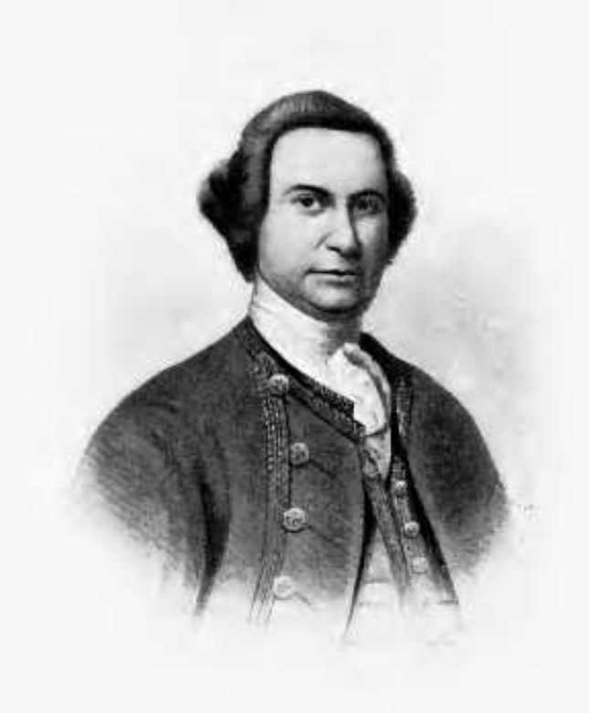
SIR WILLIAM JOHNSON.