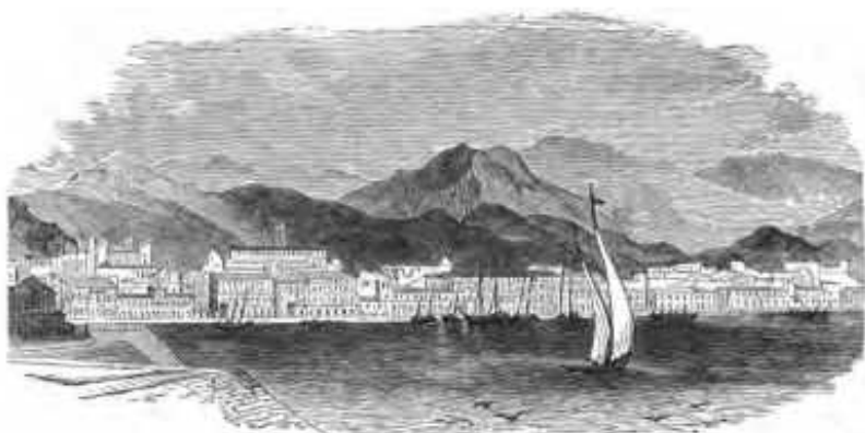
MESSINA, FROM THE SEA.