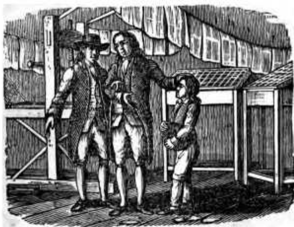
Reconciliation of Franklin with his Brother