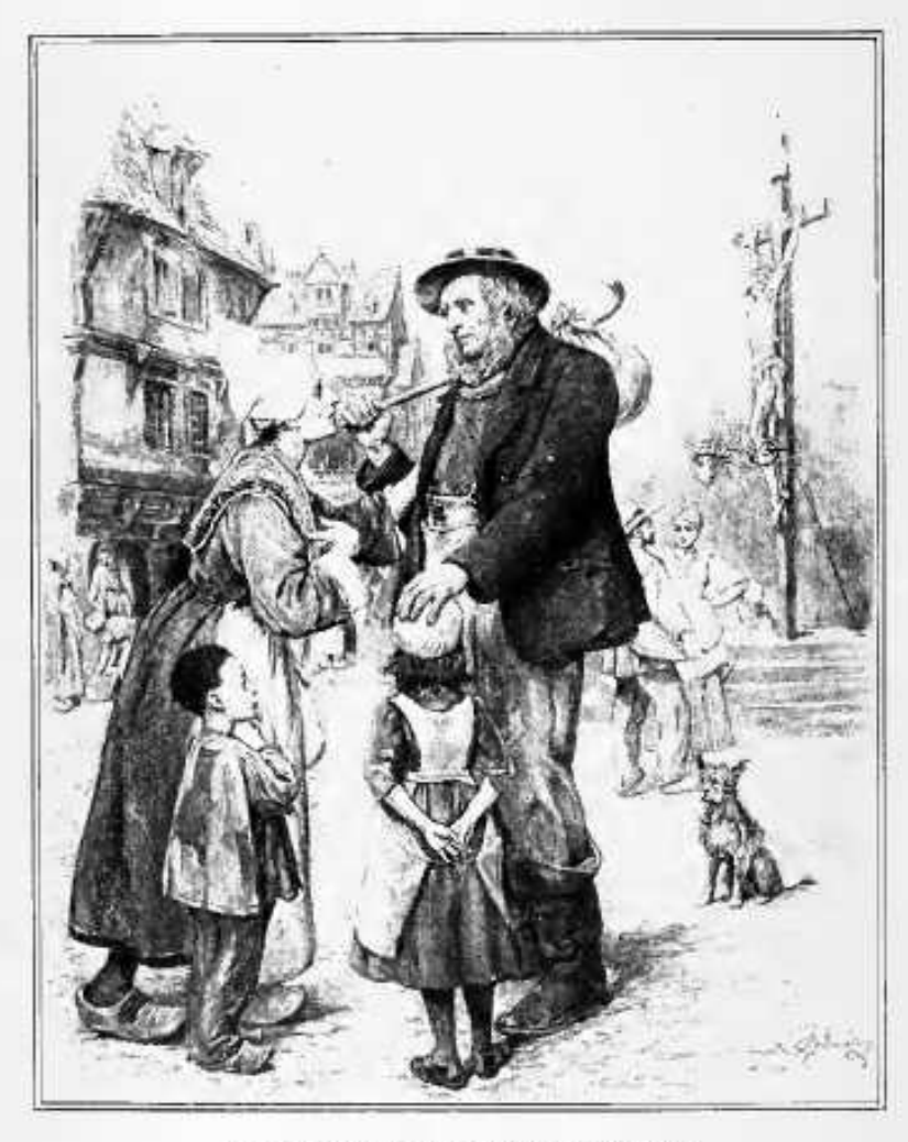
MR, PEGGOTTY (David Copperfield) From Etching by Frederick Barnard Courtesy of Cassell & Company, Ltd., London