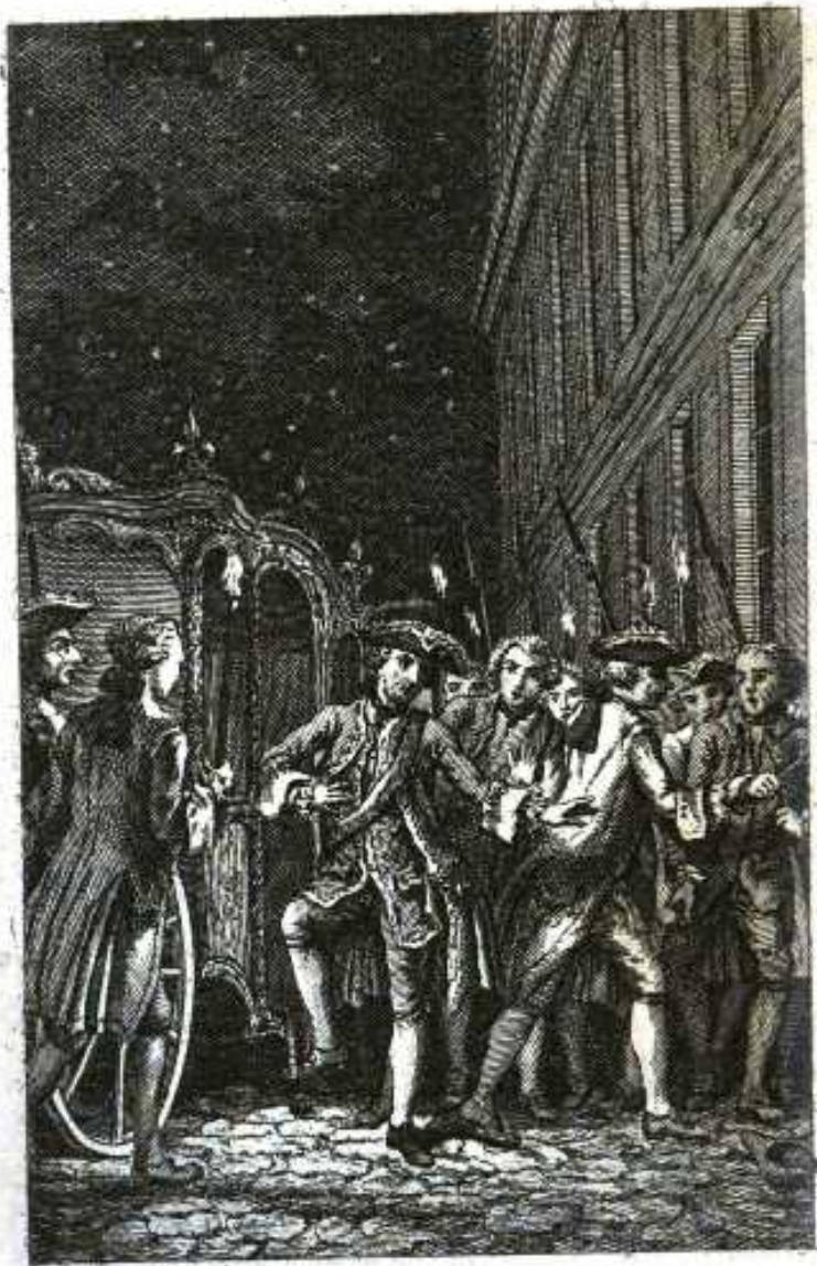
1763 del. 1763 sculp. Louis, le 15 e King of France, stab'd by Damiers.