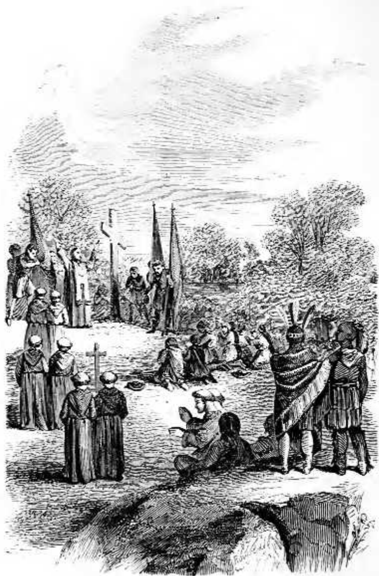
DE SOTO AND HIS COMPANY OFFERING PRAYER FOR RAIN.