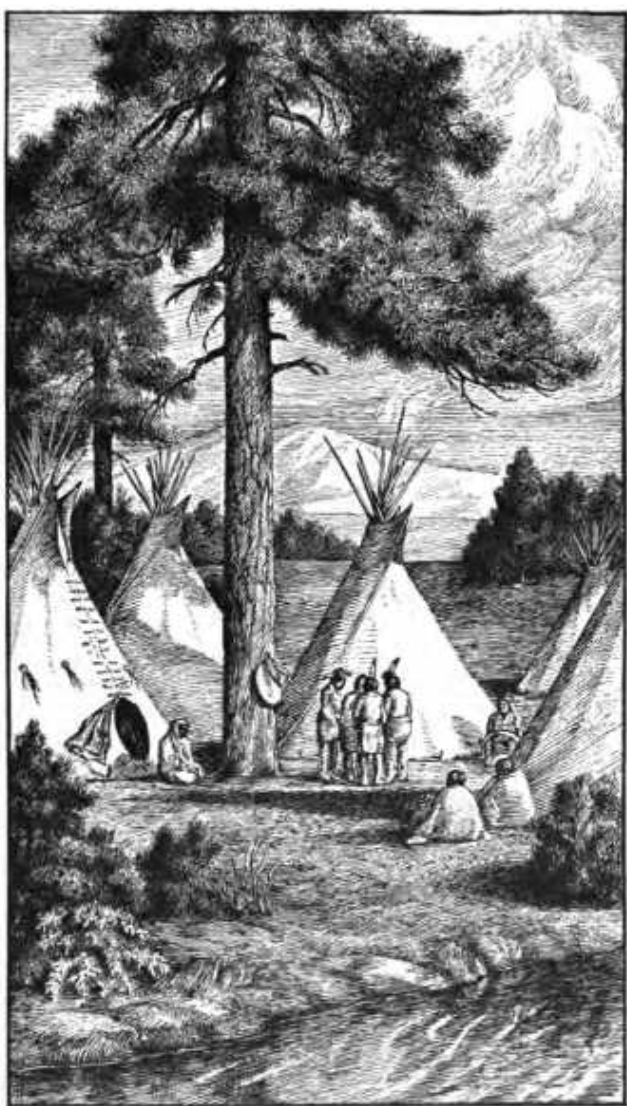
The camp of the Salish