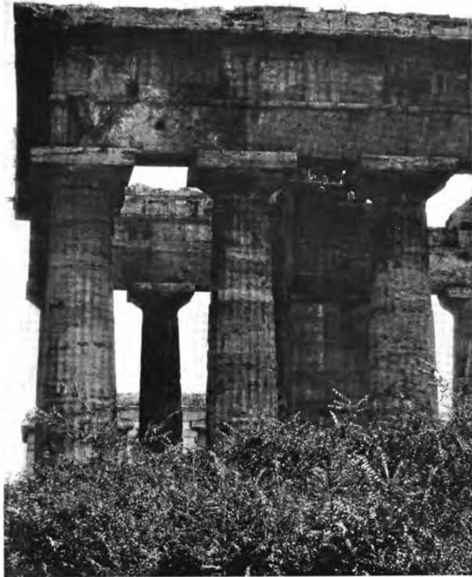
Fig. 1. Curves in Plan, Concave to Exterior, in Capitals and Entablature. East front of the so-called Temple of Poseidon at Paestum, looking from north to south.