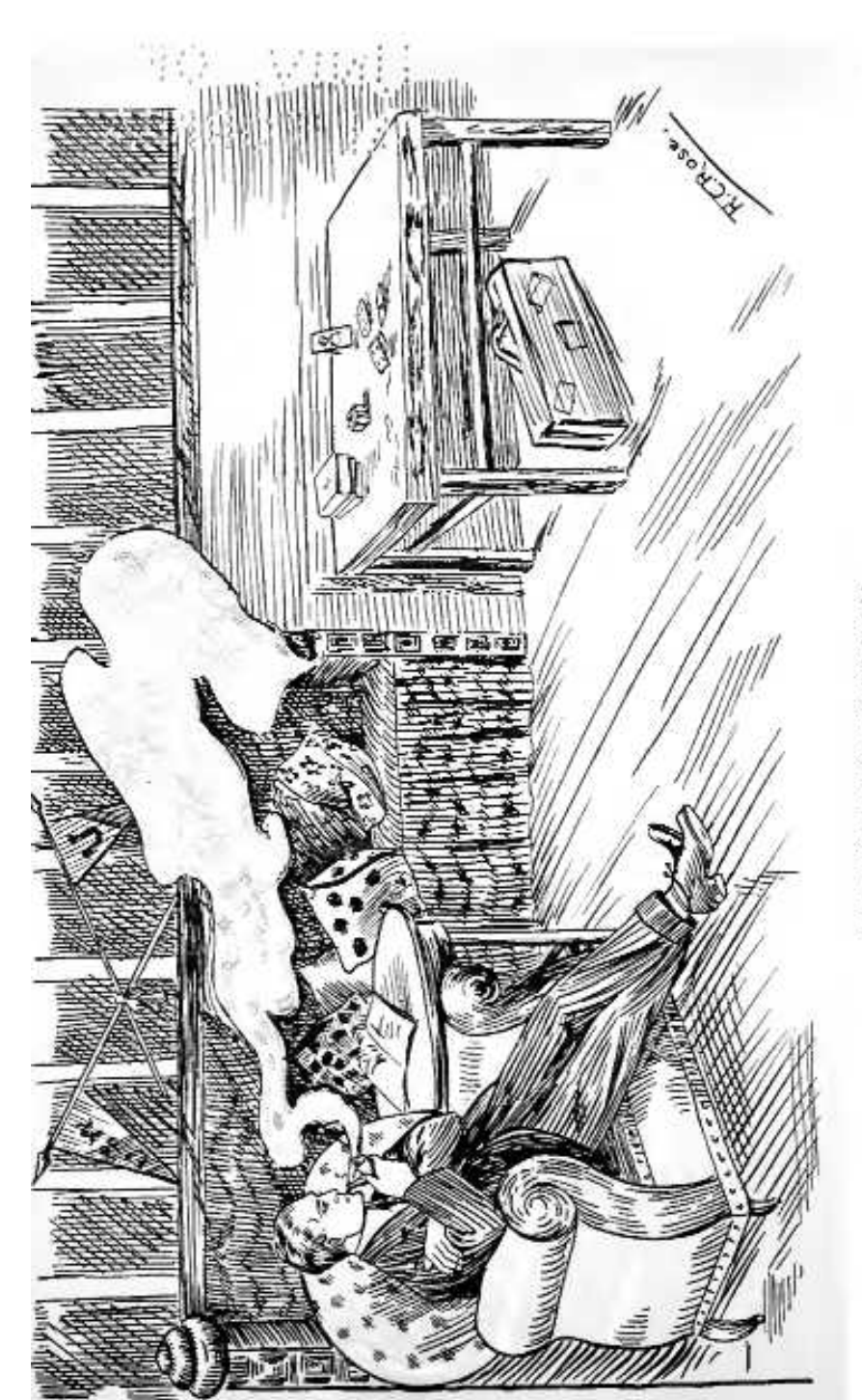
THE STUDENT'S DREAM.