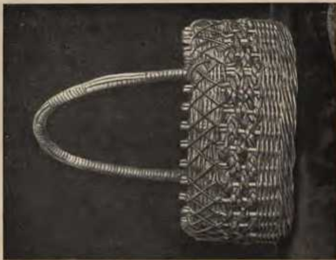
EGG BASKET No. 1.