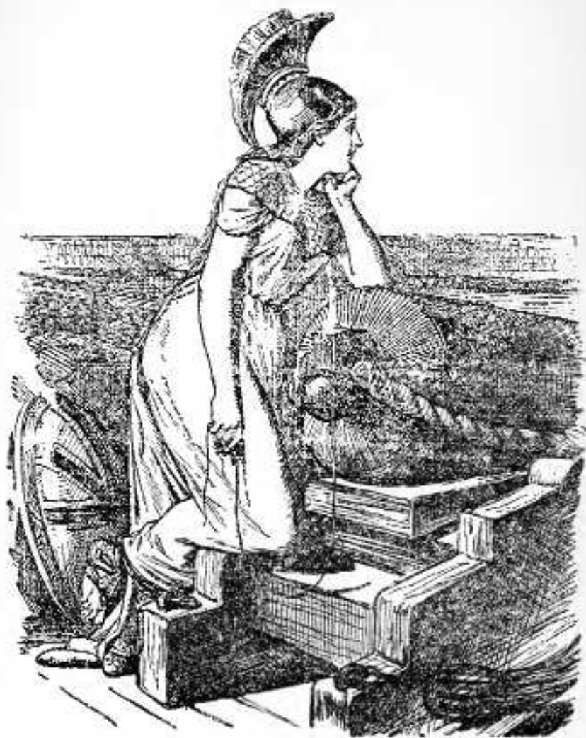
THE CALL OF THE MOTHERLAND. (See page 42).