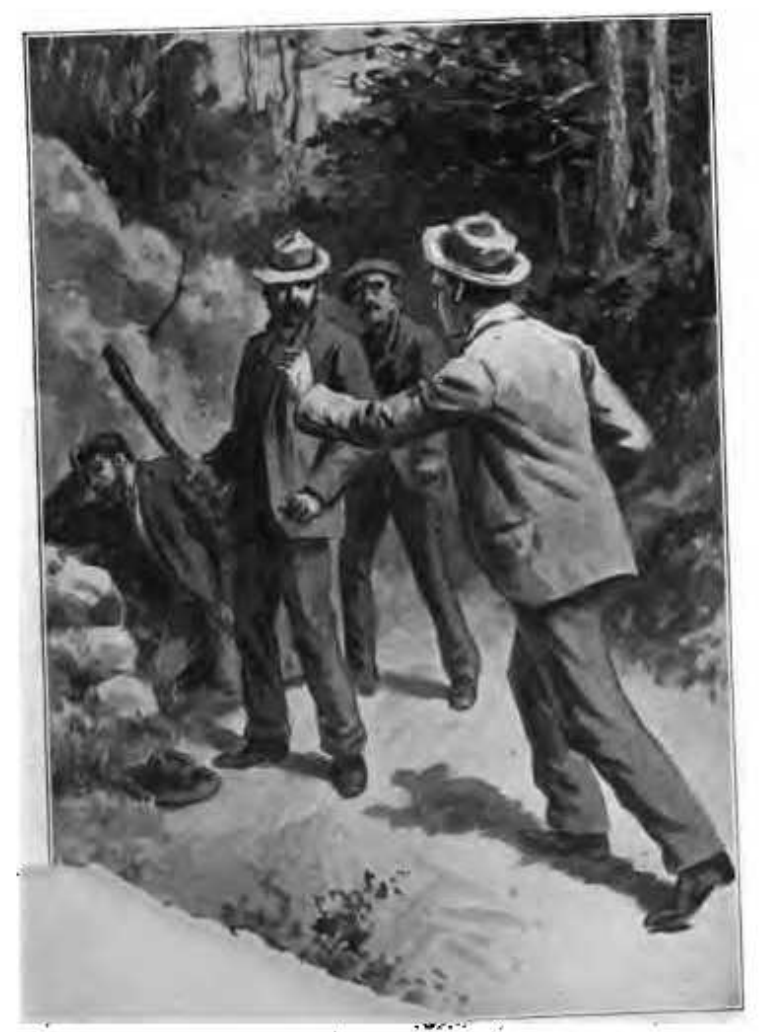
urveyor. — Page 23.