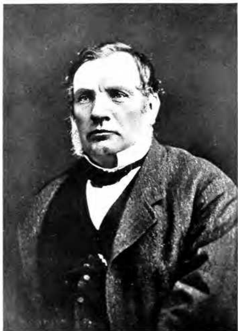
SIR DONALD McLEAN