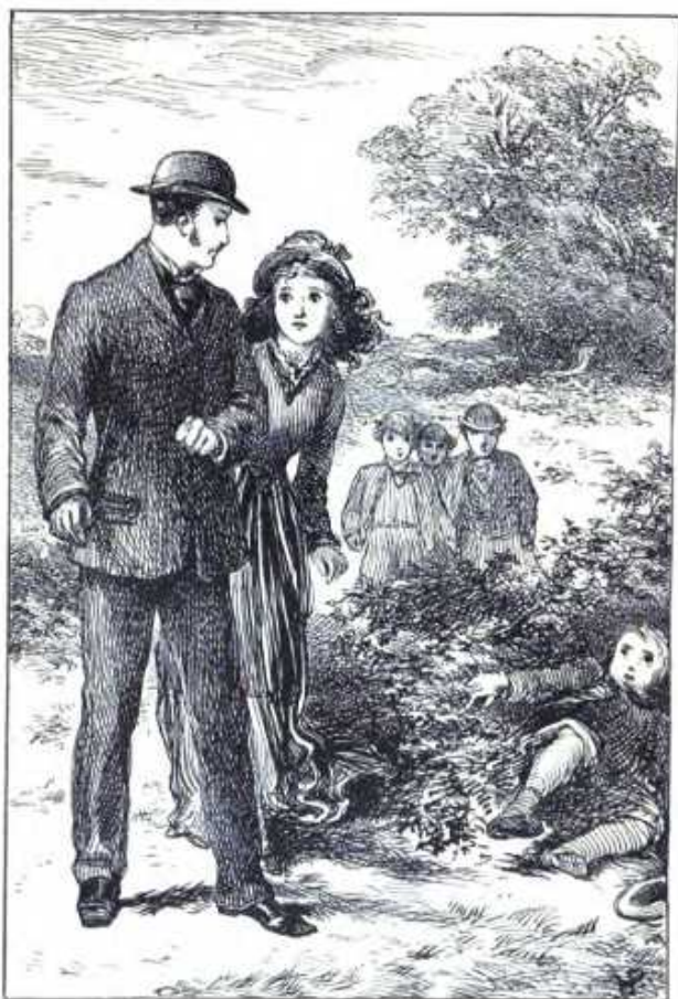
"IN TWO SECONDS AFTERWARDS THE BOY WAS LYING, SPRAWLING IN A BED OF FURZE AND BRACKEN."—p. 74.