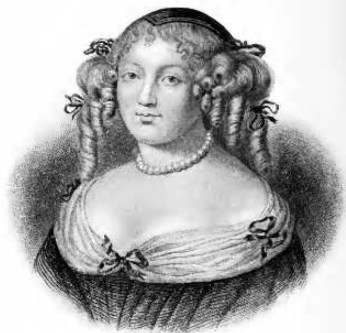
MME. DE SÉVIGNÉ