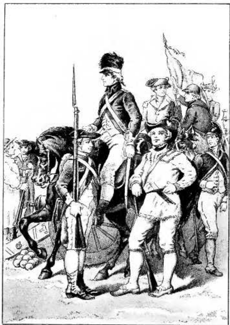
THE OLD CONTINENTALS.