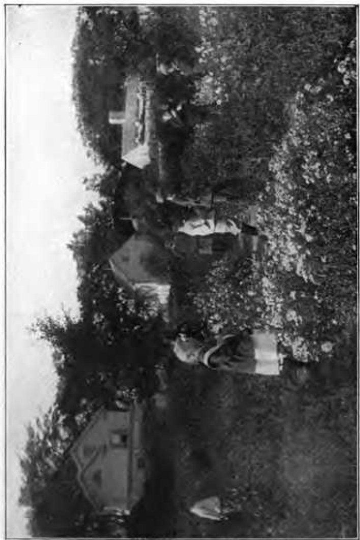
IN THE SCHOOL GARDEN