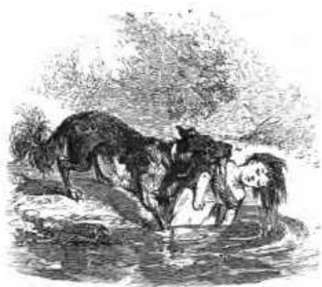
Mon saves Hal's life.—P. 42. Oard Little Pet Book.