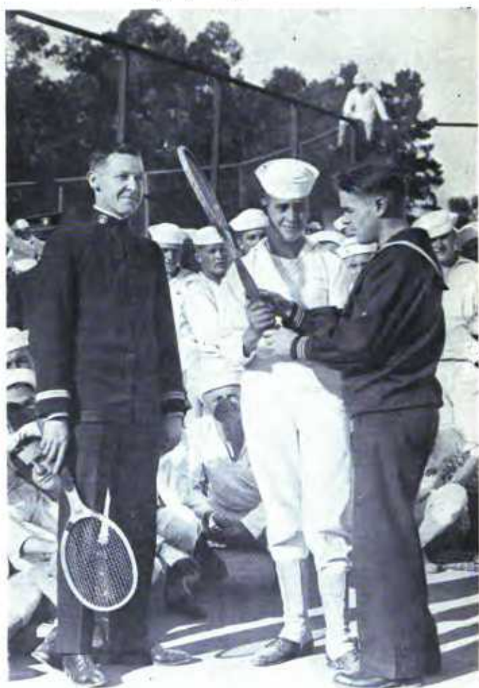
Well-known tennis players giving Jackies at Mare Island a few pointers