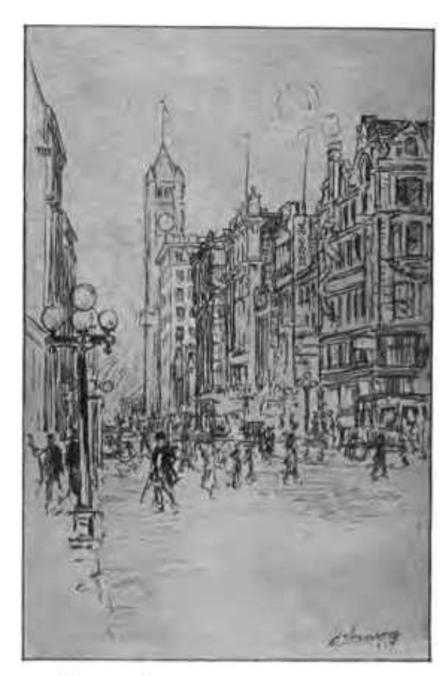
FOURTH STREET LOOKING EAST FROM NICOLLET AVENUE