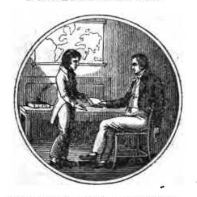
" My son be wise, and make my heart glad." Prov. xxvii. 11.