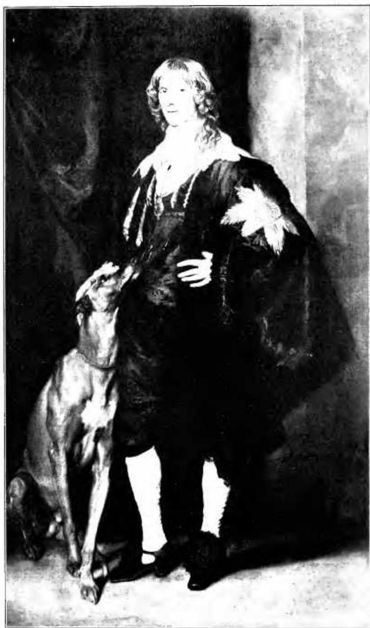
DUKE OF RICHMOND.