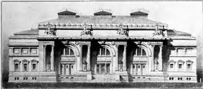
THE NEW WING.