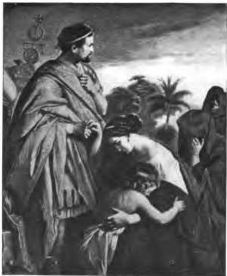
Vol. "EVEN HE, YOUR WIFE, THIS LADY, AND MYSELF ARE SUITORS TO YOU."