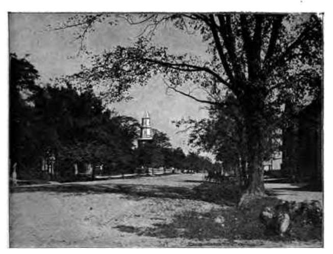
DUKE OF GLOUCESTER STREFT LOOKING EAST.